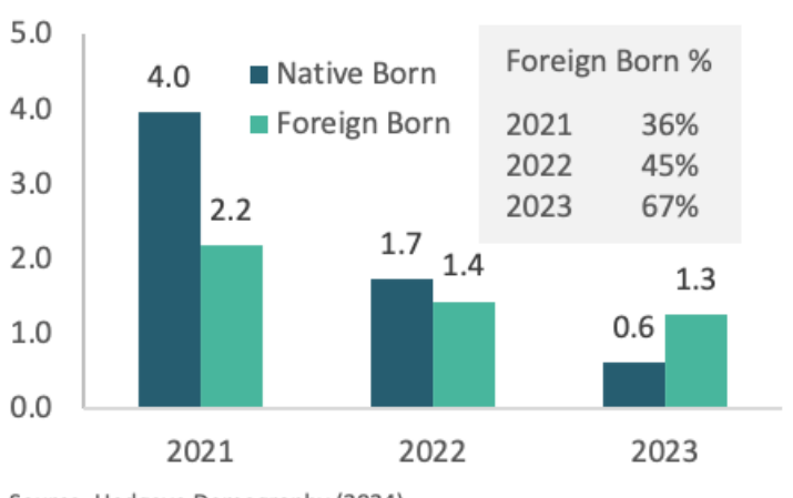
Figure 2 Growth in U.S. Employment, in Millions, by Birth Status of Workers, 2021–2023

back to where they were before the pandemic. Still, employment has continued to grow, mainly because the number of foreign-born workers has continued to grow. According to an analysis of Current Population Survey data by Hedgeye Demography, foreign-born workers accounted for 36 percent of the total growth in U.S. employment in 2021. In 2022 they accounted for 45 percent of it and in 2023 they accounted for 67 percent of it.<sup>2</sup> (See figure 2.)